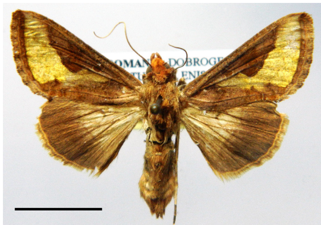
Fig. 1. Thysanoplusia orichalcea , Enisala Fortress, Tulcea county, northern Dobrogea, 24.VII.2020. Scale bar is 10 mm.

Material: 1♀, 24.VII.2020, Romania, Dobrogea, Tulcea county, Enisala Fortress, 88 m (44.8833°N, 28.8355°E) (leg. L. Székely and V. Dincă) (Fig. 1).