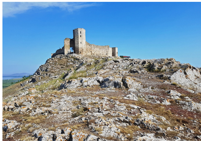
Fig. 2. Enisala Fortress, Tulcea county, northern Dobrogea, 25.VII.2020.