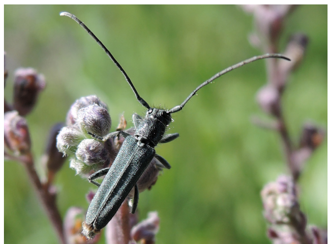
Fig. 5. Opsilia caeruleascens