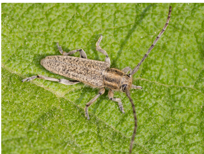
Fig. 4. Pilemia hirsutula