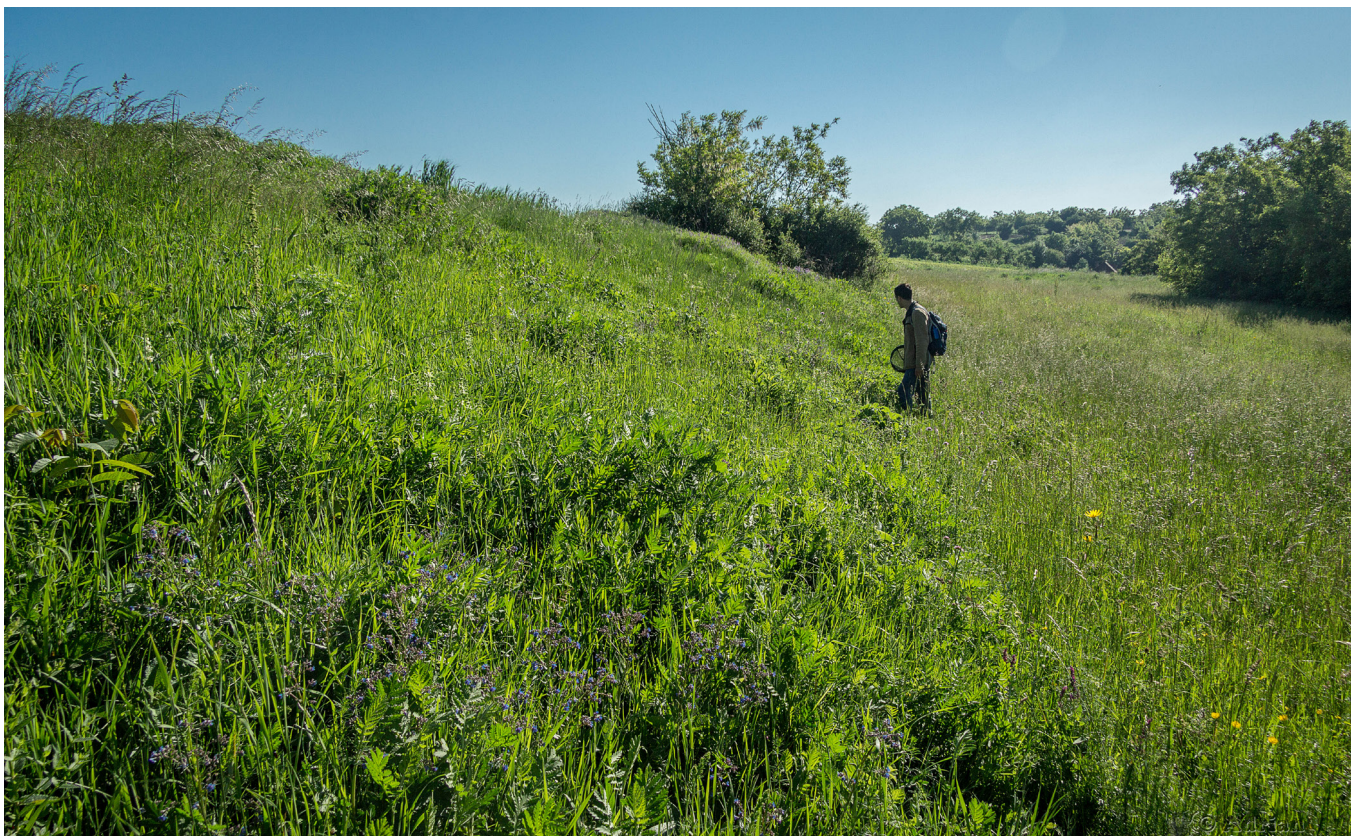
Fig. 6. Pilemia tigrina habitat, in Boju Cătun

Due to the fragmentation of habitats as a result of human activities over the past one hundred years (intensification of agriculture, infrastructure works, extension of human settlements), most of the populations of this species are virtually isolated from each other. Under these circumstances, even if it is more difficult to put it into practice, it would be important to make ecological corridors to connect