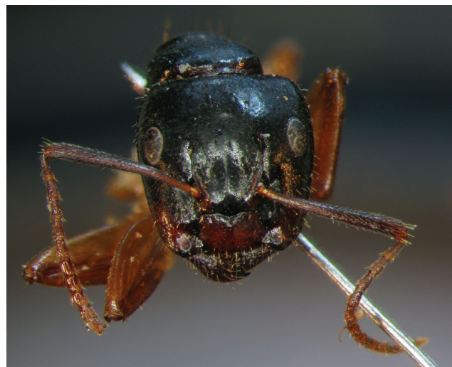
Fig. 2. Head of C. tergestinus .

20 or more vs. less than 12 standing hairs. Last, C. tergestinus has a longer pubescence especially on gaster (see Fig. 1), where the lateral distance between two hairlets is often similar to the length of one of them, whereas in C. fallax the pubescence is minute and sparser.