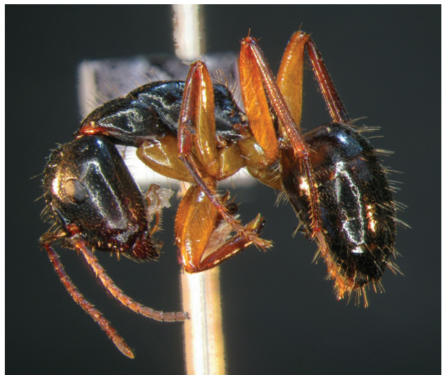
Fig. 1. Lateral view of C. tergestinus .

Head punctuation of C. tergestinus is coarser and the pilosity distinctly more abundant: head dorsum, excluding clypeus, with at least 16 vs. eight erect hairs; gena with many short, erect hairs vs. glabrous (Fig. 2); scape with decumbent to appressed pubescence and a row of erect setae vs. appressed pubescence only; propodeum with ca.