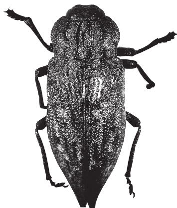
Fig. 1. Dicerca (Argante) moesta (F.) - specimen collected from Băile Herculane (15.06.2005)